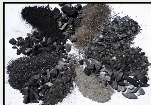
Above: Photo showing variation of biochars.

There may be trade-offs associated with biochar production and benefits to growers. One example is that the use of certain types of wood waste may not produce biochar with agronomic benefits, which represents a win for waste reduction and carbon sequestration, but does not maximize potential benefits to growers. 11 A number of long-term biochar field trials are ongoing, and may provide information to aid growers in making informed, science-based decisions about its land application.