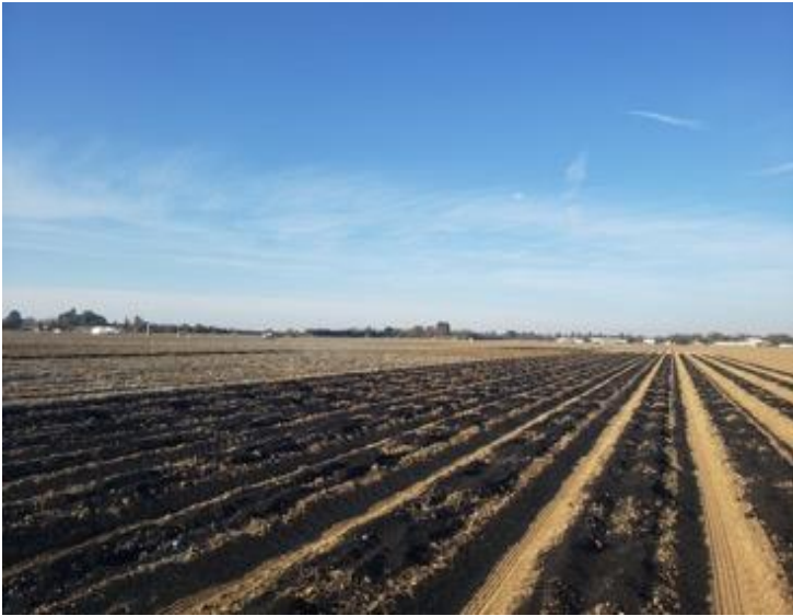
Fields amended with biochar.

This fact sheet is the final installment of a four-part climate-smart agriculture series exploring the relationship between carbon farming, soil health, and soil amendments on CA croplands and rangelands. This fact sheet focuses on biochar amendments and previous fact sheets address the benefits of compost and pulverized rock. The series is intended for members of the technical assistance community who advise CA growers on climate-smart agriculture.