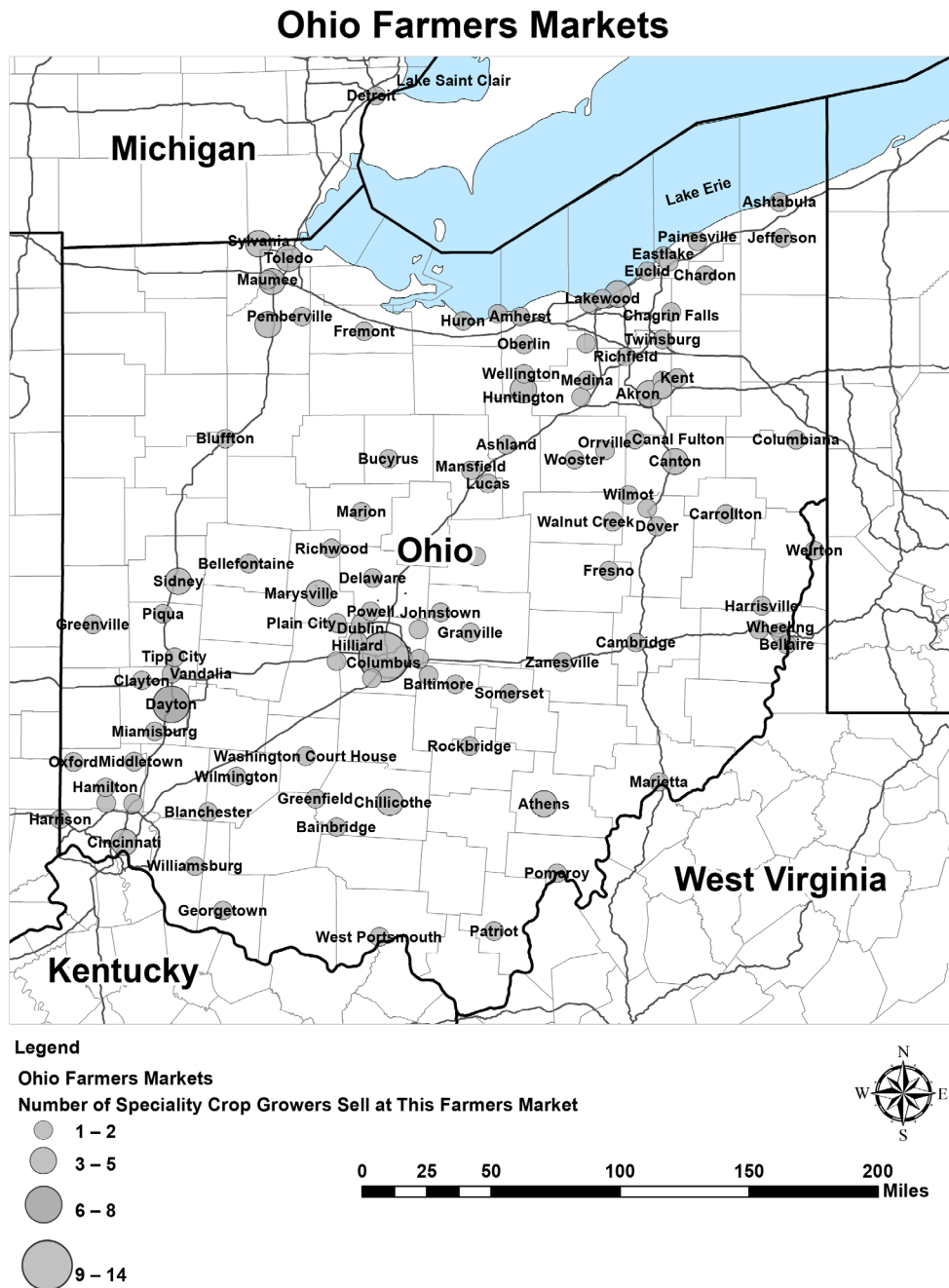
Figure 3. Farmers market distribution in Ohio and the number of specialty crop growers who sell at those markets.