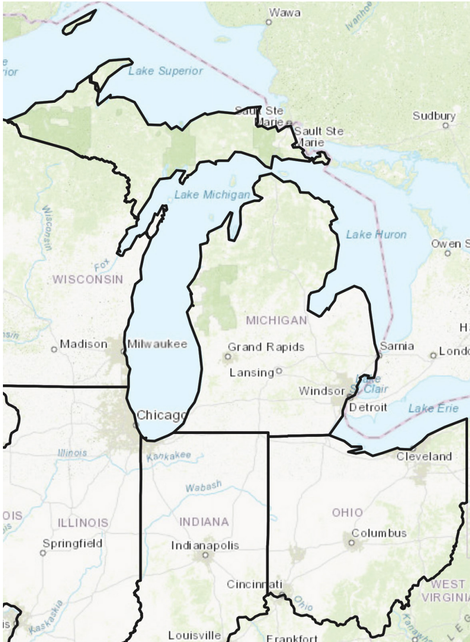
Figure 1. The geology and climate of the Great Lakes influence soil types, precipitation and temperature variations, microclimates and changing climatic conditions that Michigan and Ohio specialty crop growers factor into their management decisions.

Lake Erie, one of the five Great Lakes of the United States. In recent years, Lake Erie water quality has been a major concern with particular interest in agriculture's contribution to excess nutrients flowing off-farm into local waters and the lake. The climate of the region is strongly influenced by the Great Lakes and in recent years has experienced an increase in annual precipitation and storm intensities, which influence soil moisture and specialty crop management and production decisions.