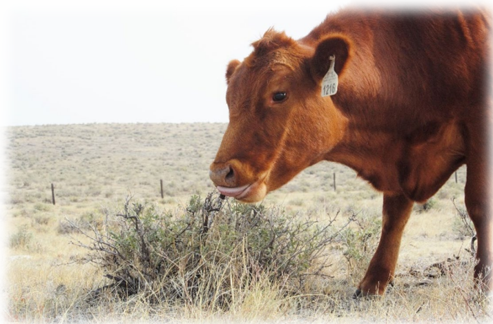
Pickings were slim for livestock in drought-affected areas this year.