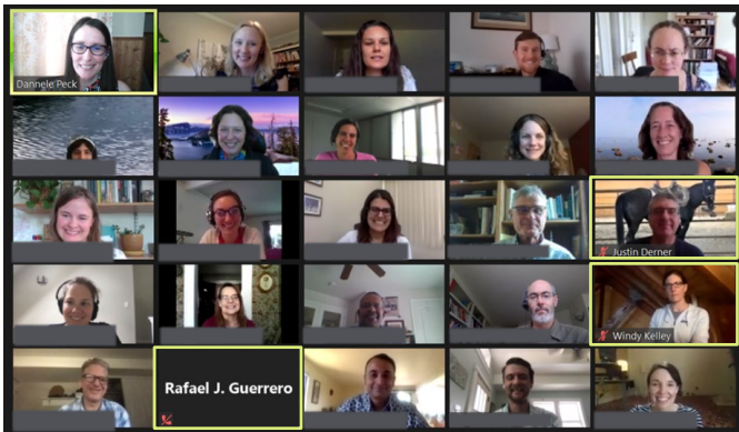
Screenshot of NPCH, WWA, and NC-CASC participants during the 3-Centers' 2020 Virtual Summer Retreat.

USDA Northern Plains Climate Hub U.S. DEPARTMENT OF AGRICULTURE