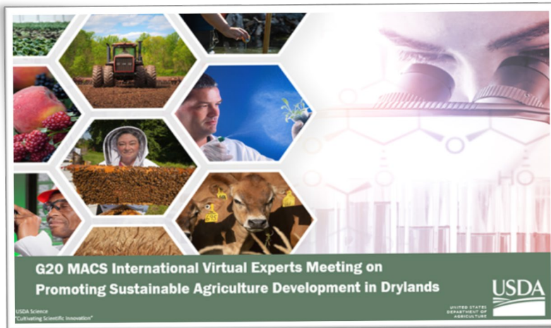
Title slide from the USDA Office of the Secretary's presentation at the G20 MACS International Virtual Experts Meeting on Sustainable Dryland Ag.

The Northern Plains Climate Hub contributed tools, resources, and references to the USDA Office of the Secretary to inform a presentation at the G20 MACS International Virtual Experts Meeting on Promoting Sustainable Agriculture Development in Drylands . The presentation, "Collaborative US Research Highlights," showcased Grass-Cast as one of five U.S. research and outreach efforts "providing farmers, ranchers, and agricultural partners access to tools and resources that enable sustainable agriculture and science-based, data-driven decision-making."