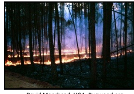
David Moorhead, UGA, Bugwood.org

Site Preparation: Keeping some residual vegetation on site will help keep soil temperatures low and help maintain nutrients and soil moisture as temperature and rainfall levels fluctuate. Wider-spaced site preparation (for example, during bedding) could be used to help minimize future threats. Herbicide prescriptions may also need to be altered as invasive plants become more aggressive and new species move into the region. Site preparation through the use of prescribed fire will remain an important tool, but in some instances may need to be replaced with heavy equipment or herbicide alternatives due to rainfall or drought-related controlled burning limitations.