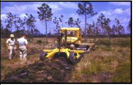
John D. Hodges, MS St., Bugwood.org

Planting: Tree nurseries that diversify their seedbanks, by using either mixes of species or mixes of genetic traits from a single species, will help forest owners hedge their bets against future threats. Single-aged monocultures from a single genetic origin will be the most susceptible to future threats, while multi-aged mixed forests consisting of species with varying traits will be the most resilient. Choosing species known to grow in a wide range of conditions and withstand disturbance, including heat and drought stress, will also help maintain the health of the forest. The single decision of "what kind of tree seedlings to plant" will have lasting impacts on how you manage and maintain the health of your woodlands for decades to come.