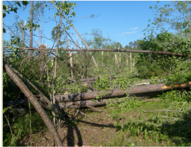
When assessing storm damage, be aware that roads may be washed out and trees may be down, blocking access to your forest.