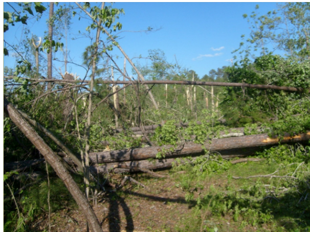
When assessing storm damage, be aware that roads may be washed out and trees may be down, blocking access to your forest.