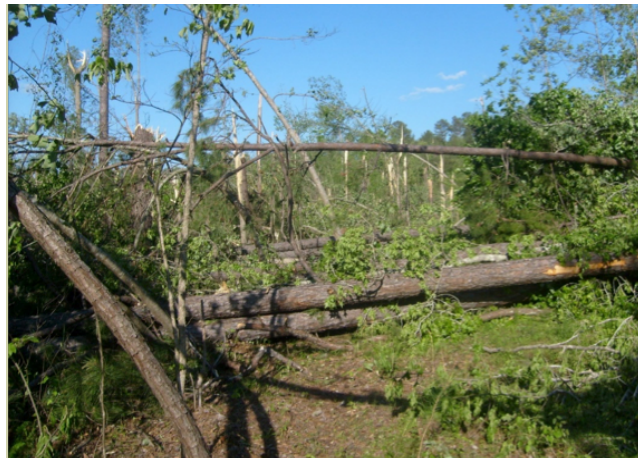
When assessing storm damage, be aware that roads may be washed out and trees may be down, blocking access to your forest.