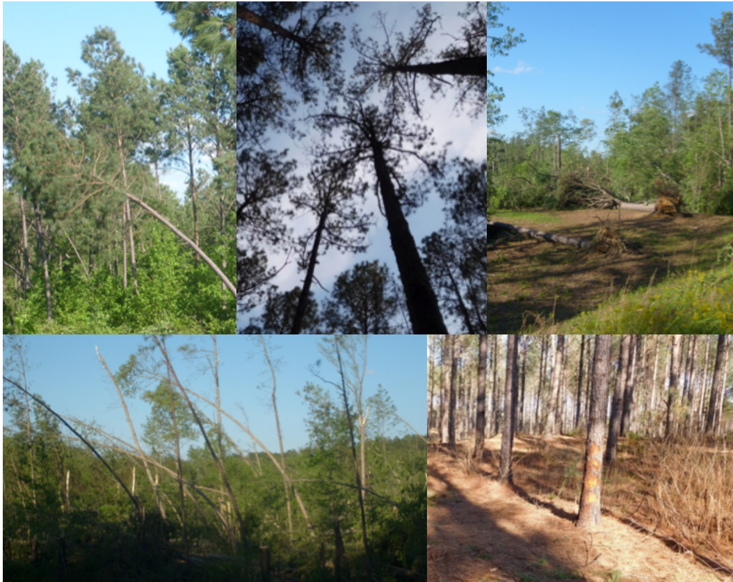
TOP LEFT TO RIGHT: PHOTO 1) Minor bending/leaning; PHOTO 2) Broken tops with most of the crown in place; PHOTO 3) Uprooted trees