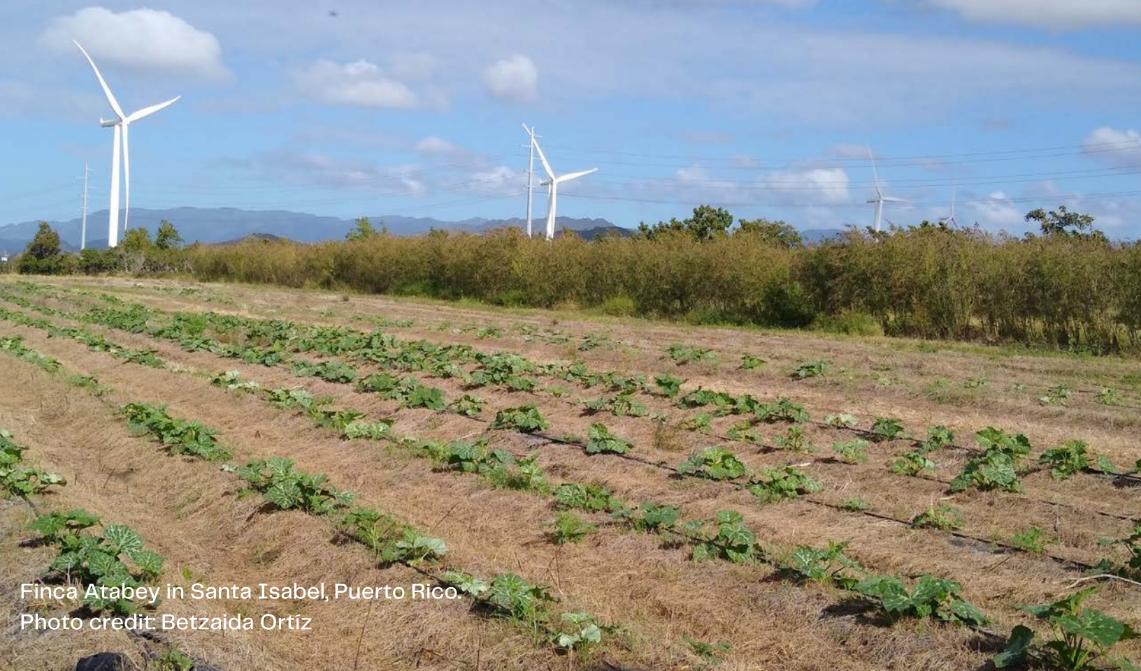
Finca Atabey in Santa Isabel, Puerto Rico