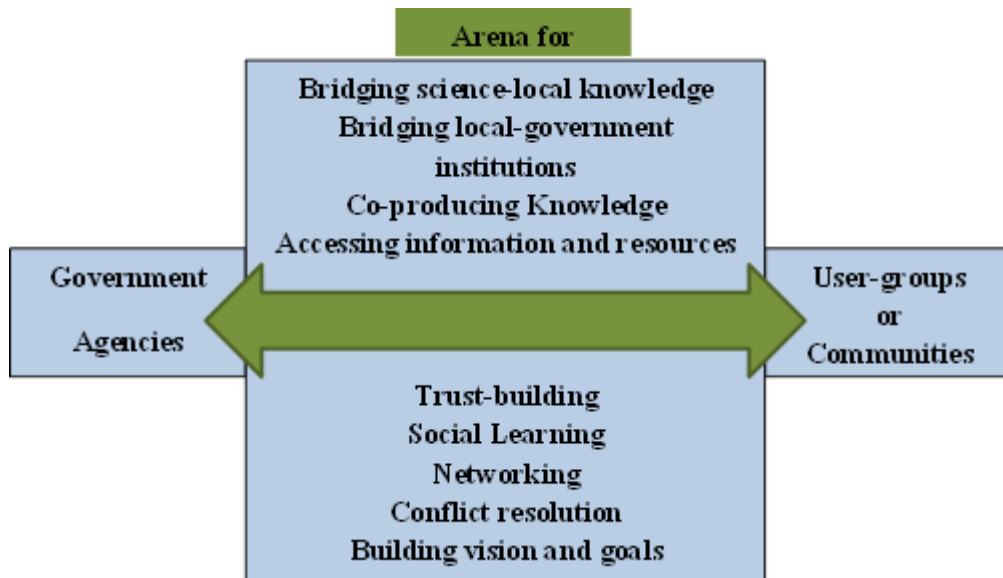
Figure 1: Potential roles of bridging organizations. Fulfilling all these tasks may require cooperation among various bridging organizations playing different roles. Taken from: Berkes, 2009.

Collins and Evans (2002) developed a model of expertise that is helpful in conceptualizing the role of bridging organizations. In their model, science represents a realm of knowledge and expertise that is abstract or generalizable while experience represents a realm that is specific and locally based. Both realms represent valuable forms of contributory expertise . These forms are distinguished from interactional expertise , defined as: “Having enough expertise to allow for interesting interactions between contributory experts of both abstract/generalizable and local/practical knowledge domains, which allows for interactions to occur to the extent that all participants leave the process cognitively changed” (Carolan, 2006 pp: 423). In the context of agriculture, forestry and climate change, this would involve bringing together scientists, planners and policy makers from governmental and non-profit organizations with local farmers and forest landowners and facilitating the sharing of ideas and experience in a productive and respectful way.