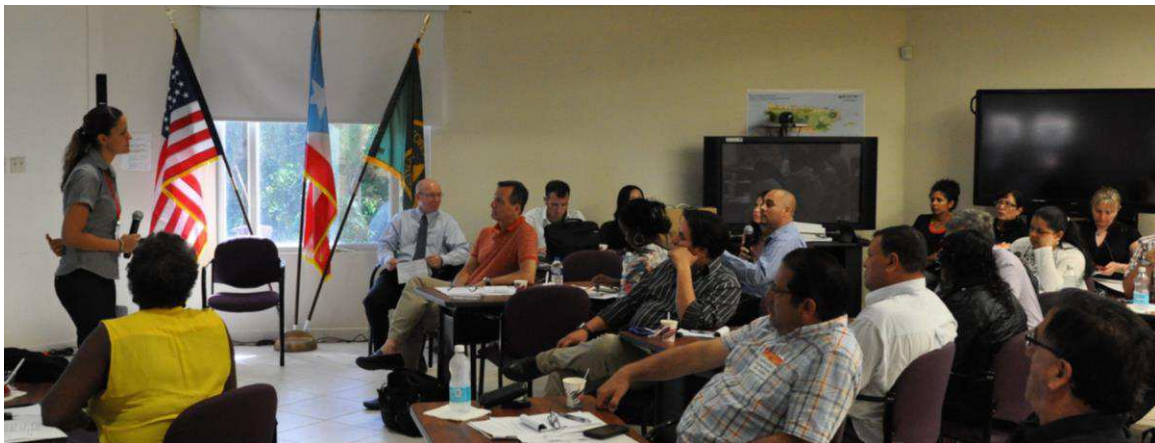
Picture 1: Participants from Mexico, Panama, Guatemala, Honduras, El Salvador, Barbados, Nicaragua, and Costa Rica met for a two-day workshop with USDA representatives from the National Climate Hubs Network and the Foreign Agricultural Service to strengthen collaboration in addressing climate change issues in agriculture and forestry in Latin America.