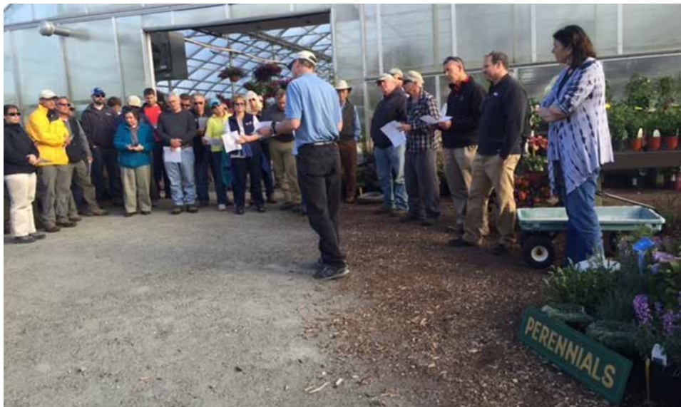
Participants at RINLA Twilight Meeting at Clark Farms and Morning Star Nursery.