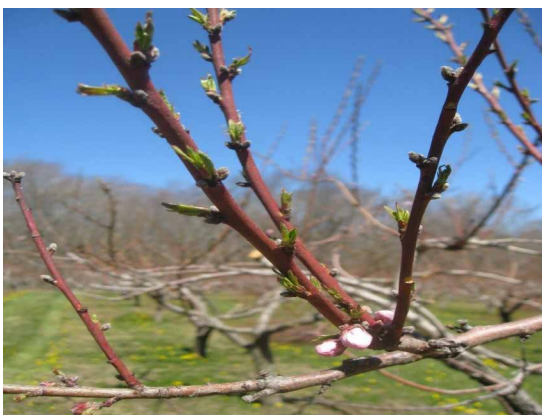
What we actually saw: dead branches!