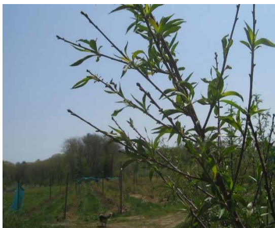
What we actually saw: no blooms!

es, or find the few growers in RI that report some surviving peaches. You will be lucky if you find them.