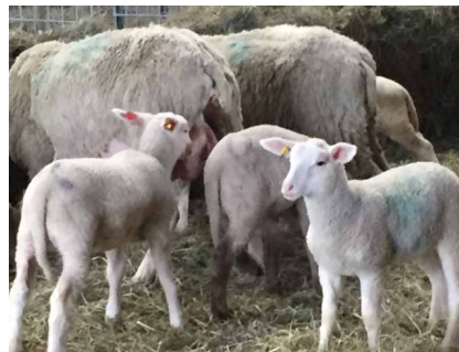
Ewes and young lambs, Signal Rock Farm, Charlton, MA

producers in RI and our unique crop profiles.