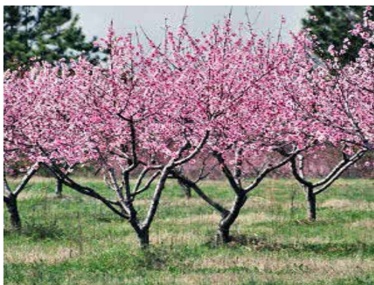
What we should have seen: blooming trees!

The lack of a normal peach crop extends from New Jersey to Maine, So this year you may have to travel south as far as Georgia to get fresh peach-