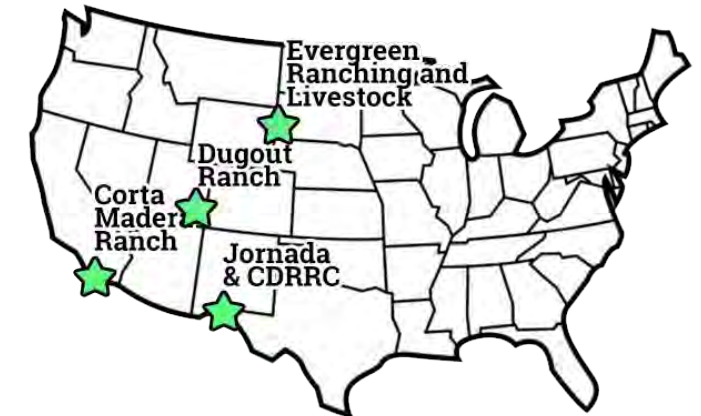
Five SW Beef CAP participating ranches where the precision ranching system will be tested. Preliminary tests have begun at Chihuahuan Desert Rangeland Research Center (CDRRC) in southern New Mexico where the system is currently being calibrated.

The Southwestern Beef Coordinated Agriculture Project, a large USDA-NIFA funded effort, will develop and test a precision ranching system able to log, transmit, and analyze animal, weather, and drinker sensor data in close-to-real time using a Long Range Wide Area (LoRa Wan) network (technical details provided below). This system will be installed at five participating cow-calf ranches. Costs and savings from this technology will be assessed via enterprise budgets and rancher surveys to determine the pros and cons of implementing a PR system on commercial ranches. With this understanding of cost savings and feedback from participating ranchers, a market-ready product is expected to be available by 2026.